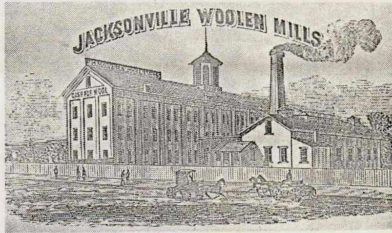
The Capps Mills 1873.

wearing Indians. The mill did a quite important volume of business in these blankets. It made a careful study of the characteristic colors and patterns used in blankets woven by craftsmen of different Indian tribes and maintained the accuracy of colors and designs. For a time the mill advertised these blankets in publications of national circulation and sold them direct to individuals. Some of the Indians resold blankets to tourists as genuine Indian blankets at a great profit to themselves. During the World War, the federal government requisitioned all products of the mill and factory. Thousands of trousers were made as well as quantities of khaki suiting and overcoating. The mill turned out khaki yarn and sold it at cost to Red Cross chapters at Jacksonville and nearby towns to be knitted into garments, etc.